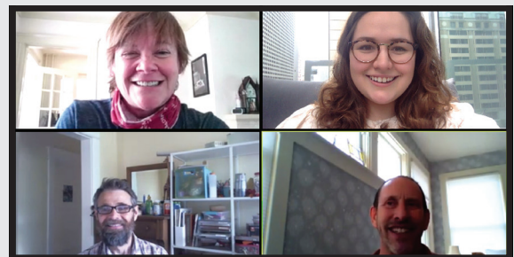
Like many of you, we have been zooming away!

Due to Covid-19, we are working from home. Please contact us if you would like to send something by mail.